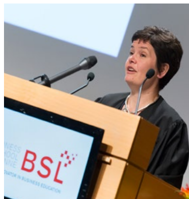
Kate Raworth speaking about her doughnut economic model during the Graduation Ceremony - July 2017