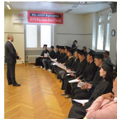
BSL-aSSIST Big Data MBA Graduation Ceremony August 2018

BSL and aSSIST also collaborate to offer a double PhD/DBA degree to South Korean students. A first cohort of eight South Korean students have now begun this double degree, attending course modules in Seoul, and with BSL Faculty supervising their dissertations.