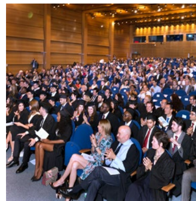
An important event in BSL's life and an opportunity to share our values with many stakeholders is our yearly graduation Ceremony.

http://www.themarkchallenge.com/edition.php?ed=2019