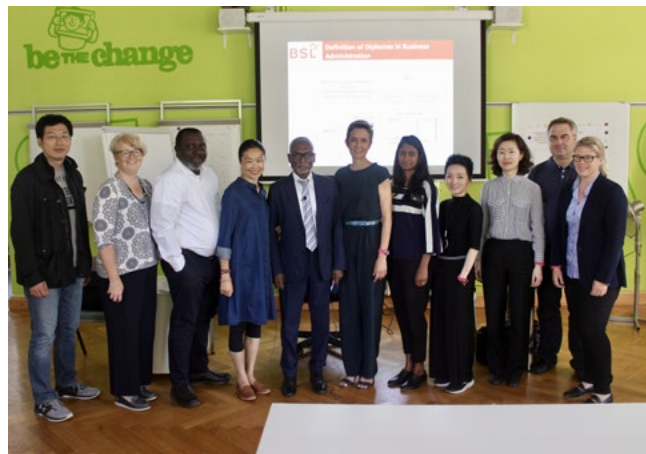
Directors, Faculty and students during a DBA Acceleration Week

Several teachers at BSL have research activities. Here are few examples of recent publications from faculty members: