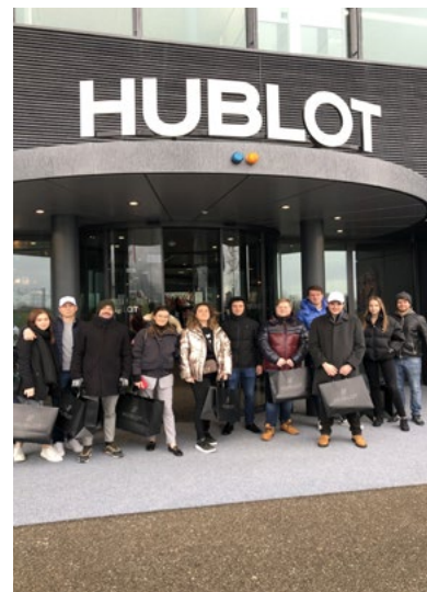
Students visiting the headquarters of the watch-making company, Hublot, in Nyon, Switzerland, as part of their BIW activities.