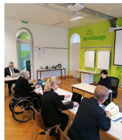
Oral Defense of aSSIST DBA candidate at Business School Lausanne - February 2020